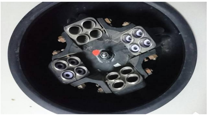
Fig 1: centrifuge 1<sup>st</sup> Spin 1800rpm x 15mins and 2<sup>nd</sup> spin: 3500rpm x 10mins

In the operation theatre with the patient in supine position, knee was scrubbed, painted and draped with sterile towels. With the patients knee in 45-90 degrees of flexion so that joint is opened for injection through lateral parapatellar approach. Under aseptic conditions, 8 mL platelet concentrate was injected into the knee joint with an 18- gauge needle without local anesthetic. 1 mL of CaCl 2 (calcium chloride) was injected in a ratio of 1:4 for every 4 mL of PRP. After the procedure Robert Jone's compression bandage applied and the knees were immobilized for 10 minutes. For any possible side effects like dizziness, sweating patients were observed for 30 minutes. During the follow-up period, nonsteroidal antiinflammatory drugs were not allowed and tramadol (dosage, 50 mg bid) was prescribed in case of discomfort; all patients were asked to stop medications 48 hours before follow-up assessment.