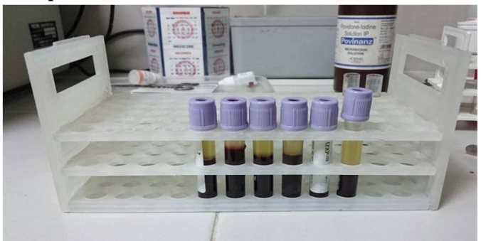
Fig2: Vacutaieners after 15 minutes of centrifuge with 1500 RPM