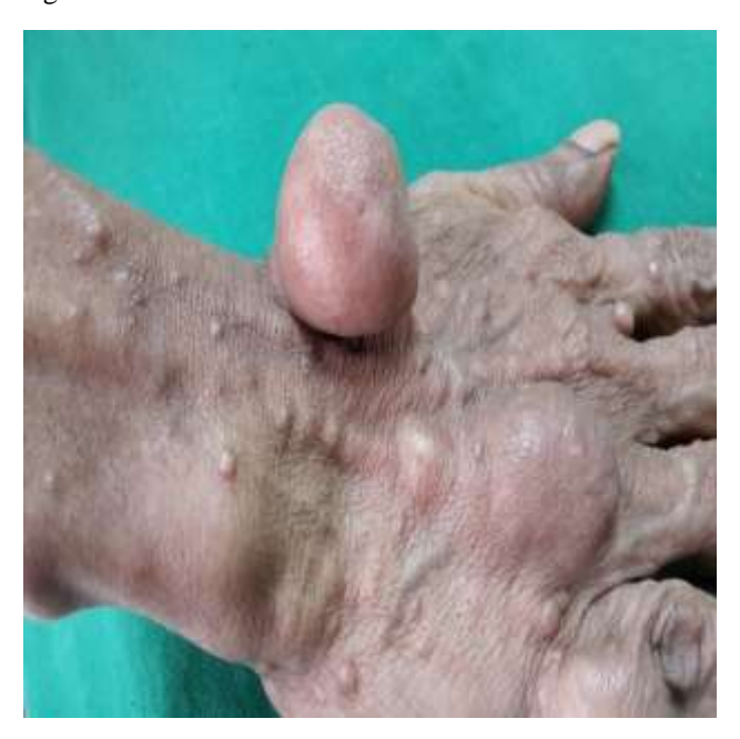
Figure 1 : Cutaneous neurofibromas.