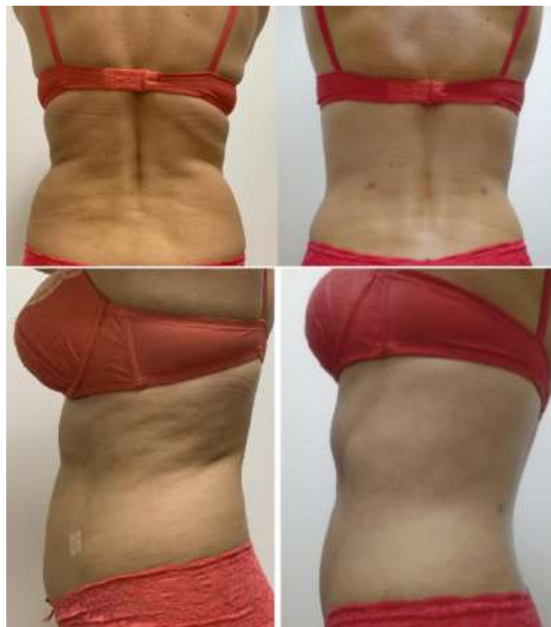
Figure 7. A 57-year-old patient underwent two treatment sessions to reduce localized fat and skin flaccidity in the dorsal, lateral, abdominal and flank regions.

In Figure 9 it is demonstrated the abdominal liposculpture procedure using the endolaser, which is characterized by the emulsification of the fat associated with the dermal lifting in order to generate an aesthetic definition of the structures of the abdominal region. After the procedure, the patient was treated with sessions of manual lymphatic drainage and therapeutic ultrasound for 10 days aiming at reducing the inflammatory edema. After 60 days, a treatment with cryolipolysis was carried out in the abdominal region in order to increase skin adherence and highlight the natural appearance of the contours caused by the action of endolaser, highlighting patient's abdominal muscles (authorial technique called "Fiber Lift HD"). It is important to emphasize that this technique was also used to reduce fat located on the flanks.