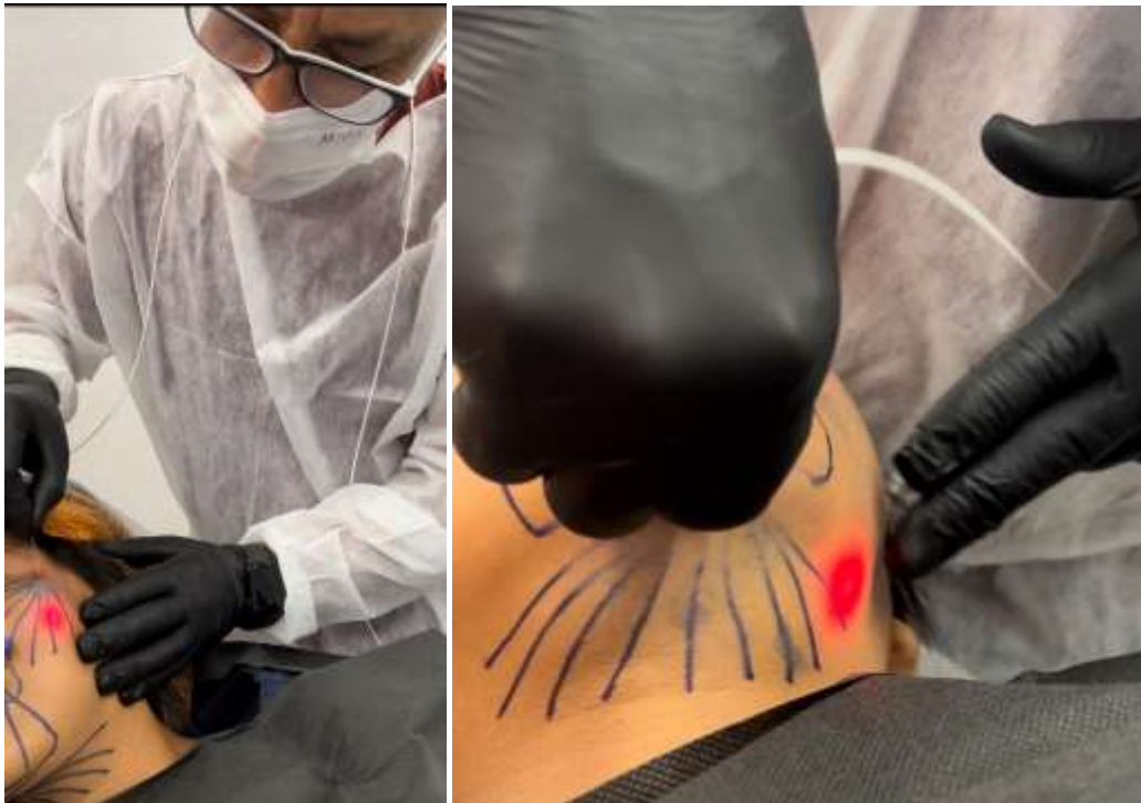
Figure 2. Endolaser marking and procedure on the face, and submental area using a 400 microns optical fiber and a 1470nm diode laser.

To produce the protocols described in this work, diode laser was used during all clinical practice with a wavelength of 980nm (Delight® - Vyndence Medical), which was also named as Fiber Lift. According to some authors [20], the 980nm diode laser devices have water (intra and extracellular) as a chromophore, however this wavelength also has recognized application in the coadjuvant treatment in liposuction, once over time it was discovered that there is an absorption curve of human fat that would have a different behavior compared to the laser action band on water. Thus, showing better absorption by fat than by water, which provides lipolysis without the need for high energy. Thus, this wavelength has been shown to be an excellent method for uniform fat solubilization (laser lipolysis by changing the permeability of adipocyte membrane, and direct injury to the adipocyte caused by the laser photothermal action).