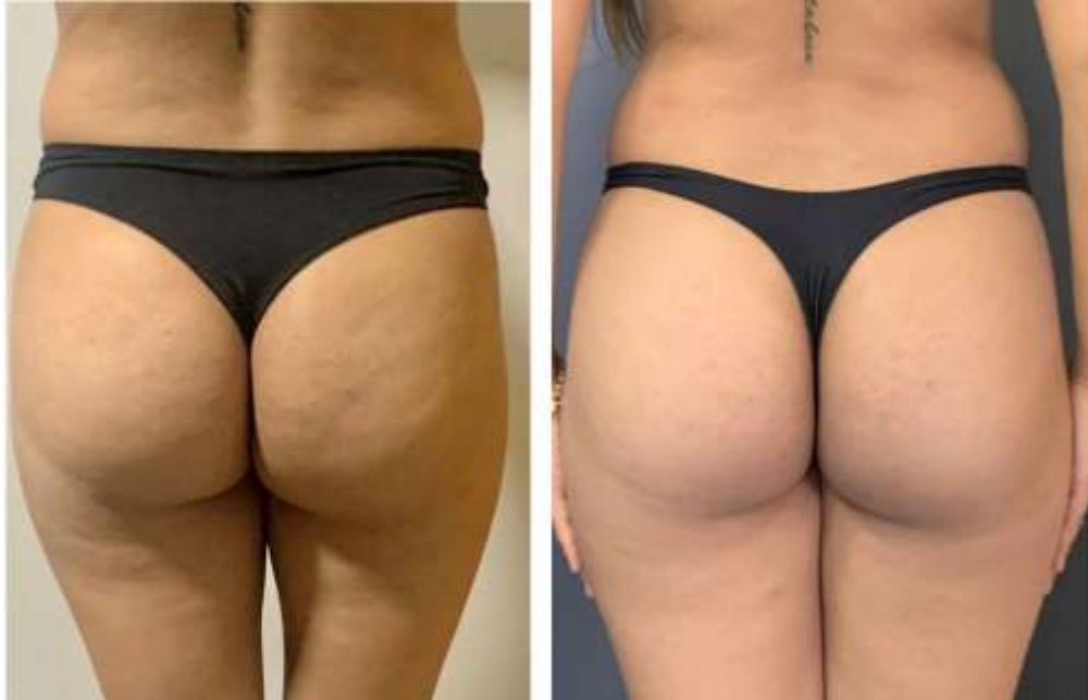
Figure 8. A 32-year-old patient underwent a butt lift with Endolaser associated with intradermotherapy with biostimulating actives. It is noticed in the image an intense improvement in skin quality (decrease in flaccidity and cellulite) and volumization of the entire gluteal region 60 days after treatment.