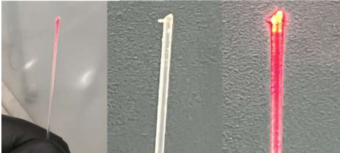
Figure 1. 400 microns optical fiber used in the endolaser technique.