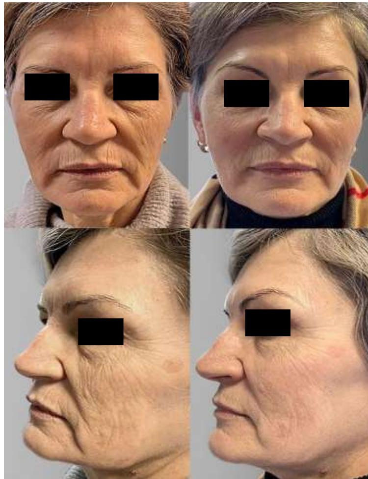
Figure 6. Before and after the treatment aimed at facial rejuvenation of a 63-year-old patient. Endolaser was used in association to other therapeutic resources. The patient was followed up at 15 and 45 days after Endolaser for treatment with microneedling and chemical peeling, respectively

Besides the association with microfocused ultrasound, microneedling and chemical peeling, in this work, endolaser was also associated with plasma jet for cases of upper palpebral ptosis, PDO threads for smoothing the nasolabial folds or deep wrinkles, in addition to radiofrequency and ozone therapy.