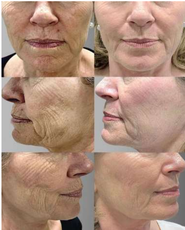
Figure 5. Before and after the treatment aimed at facial rejuvenation of a 64-year-old patient. Endolaser was used in association to other therapeutic resources. The patient was followed up at 15 and 45 days after endolaser for treatment with microneedling and chemical peeling, respectively.

In figures 5 and 6 it is noticed results with the Endolaser use associated with other resources such as microneedling and chemical peeling for facial rejuvenation. They are applied together 15 and 45 days after using the Endolaser, respectively.