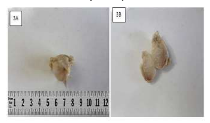
Figure 3(A and B): globular firm white swelling measuring 2.5x2x1 cm with cut surface showing homogenous solid,

On gross examination tumor was whitish in color , firm in consistency measuring 2.5x2x1 cm. Cut section was solid, creamish white and homogenous(Figure 3A and 3B).