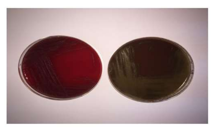
Figure 2: culture in chocolate agar plate which added a polyvitamin complex, Columbia agar supplemented with 5% defibrinated horse blood agar. Presence of monomorphic fine colony.

The puncture of the pus was rapidly sent to the laboratory of Microbiology. Gram staining was realized and it has showed a very important cellularity made of neutrophils cells and a very abundant flora made of Gram-positive cocci. A systematic culture is carried out in chocolate agar plate which added a polyvitamin complex, Columbia agar supplemented with 5% defibrinated horse blood agar, and Sabouraud chloramphenicol agar ( Figure 2 ).