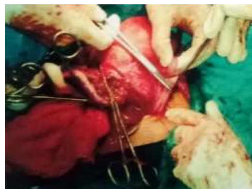
Cesarean Hysterectomy being performed in placenta accreta

A provisional diagnosis of placenta accreta was made preoperatively on ultrasonography in 6 women.2had a per operative diagnosis .6 women were taken up for surgery electively and 2 were operated on emergency basis.