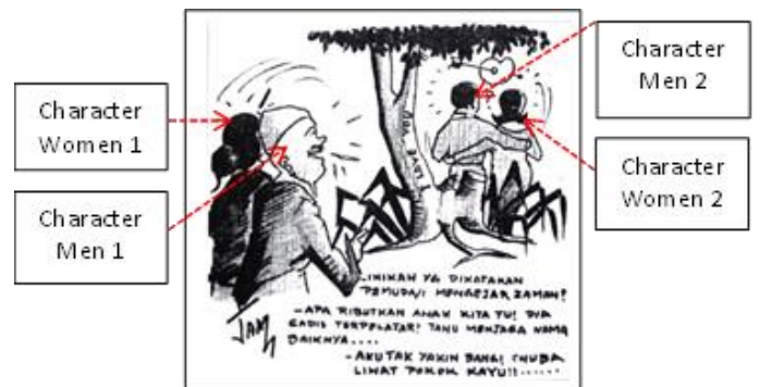
Figure 1.3: The Early Stages of Identifying Cartoon Characters

This cartoon uses four cartoon characters. The first male and female characters are married couples of 50-60s of Malays and Muslims, while the second male and female characters are youths and youths in the 20s who are lovers. The researcher uses Charles Sanders Pierce's visual semiotic analysis in directing markers and markers directly related to the cartoon to identify the characters they produce. Hence, the division of icons, indexes and symbols in this cartoon analysis has been shown in Figure 1.5. The purpose is to enable it to connect and formulate the use of the triangle of meaning with interpretation.