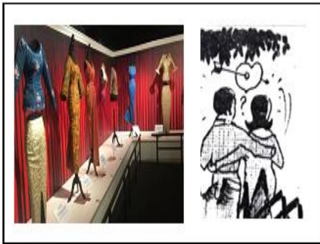
Figure 1.4: Icon Resembling Characteristics

An index showing the character of the cartoon is the child of the spouse based on the sign in the dialogue of "our child, the educated girl". This character characterized by Jamdin Buyong wears modern kebaya clothing. Researchers see that there are features that have similarities in Pierce's visual semiotic icon markers through this cartoon character dress with the 'Seniwati Saloma' garment in Figure 1.4. The obvious similarity between the fashion of the shirt and the dress of the cartoon character in this cartoon is that the cuts are similar to the modern kebaya that have a wide neck, body shape, and a fairly tight piece of fabric.