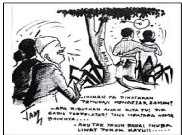
Figure 1.2: Editorial Cartoon Jamdin Buyong in Sabah Times 1967

Jamdin Buyong comes with social-themed cartoon with its own style and message. This paper was published in the Sabah Times newspaper on January 23, 1967 on page 5 of the National Language column. In contrast to his previous cartoons, he produced cartoons with long dialogue involving several important characters. The initial process is to identify the first to fourth caricature characters as shown in Figure 1.2 below.