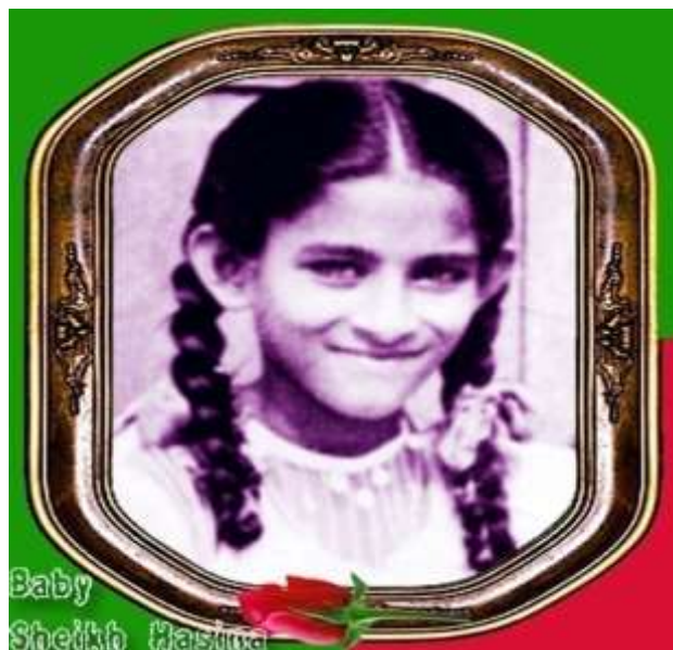
Fig-1. Hasu as a child.

She was born in Tungipara on 28 September, 1947. She began her schooling at Gopalhanj, later she moved to Dhaka in 1954 finished her SSc from Azimpur Girl’s School, HSC from