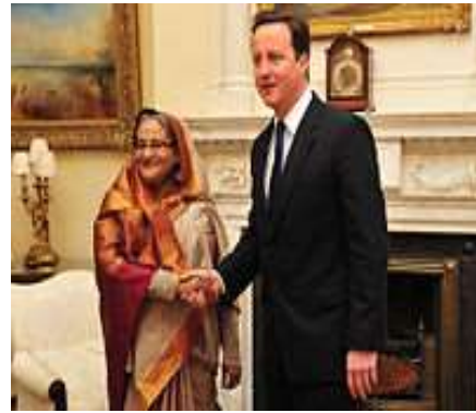
Fig-7. Desh Ratna – H E Sheikh Hasina with British Prime Minister David Cameron in London January 2011

sharply came down to four crore thirty lac (43 million) in 2010. Prime Minister is determined to pull out all the remaining out of poverty and build a hunger free and poverty free Bangladesh by 2018). In those days the country used to import food to feed the millions and now the country has a population of more than 160 million. Thanks to H E Sheikh hasina’s revolutionary Agricultural policy and the country is producing excess food to export them overseas after feeding 160 million people of the country.