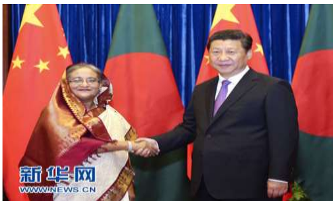
Fig-13. Chinese President Xi Jinping completed the biggest ever

His arrival in Bangladesh is like an angel has visited the country to elevate the status of the country even further beyond any imagination. He has completed the biggest ever business deal with Bangladesh which nobody could have imagined.