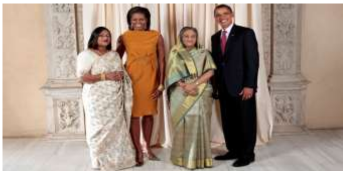
Fig-11. US President Praised Sheikh Hasina Leadership and Contribution without any reservations. (source: https://www.albd.org/index.php/en/updates/news/2945-pm-sheikh-hasina-to-co-chair-with-barack-obama ).