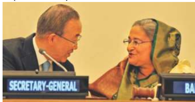
Fig-10. Reflection of true friendship with Ban Ki-moon (source:

Although he opposed the execution of War Criminals but Ban Ki Moon is a true friend of Sheikh Hasina and a well wisher of Bangladesh. Ban Ki-moon offer her to be in UN panel over telephone in February, 2016.