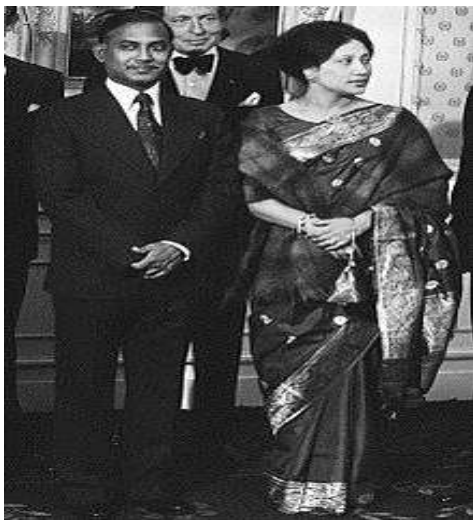
Fig-6. Begum Zia with her late husband General Ziaur Rahman.

There is a great controversy about her birth day. Her SSC certificate says 9 August 1945 is her birth date; her marriage certificate says her birth date is 5 September 1945; her passport indicates a birth date of 19 August 1945; none of her government issued any documents showing her birth date as 15 August.