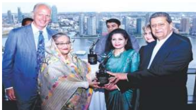
Fig-9. World ‘s recognizes H E Sheikh Hasina for Empowering Women (source: https://www.google.com.bd/search?q=how+sheikh+hasina+empowered+women&espv= ).

Bangabandhu raised her with the ideology that man and women should be treated equally and fairly and she nurtured that vision all through her political career. Her philosophy of sustainable future of planet is a shared responsibility of men and women, her dream is to create world where women rights would be respected by all, her Millennium Development Goal (MDG) of gender equality by implementing the convention on the elimination of all forms of discrimination against women (CEDAW) has been praised and awarded by world multiple world body. Her national policy for women development 2011 were aimed at : 1. Combating violence against women: 2. Ending child marriages; 3. Engaging more