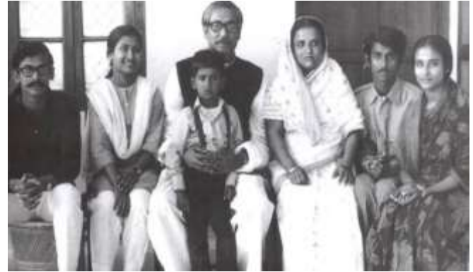
Fig-2. Complete family of Sheikh Hasina.

Intermediate Girl’s College, finished her graduation in Bangla from Dhaka University in 1973. Later in life she finished her higher education from Boston University, USA. The author had the rare opportunity to meet Bangabandhu at his residence and that was possible because of Mr. Sheikh Kamal (Fig- ) who was one of most prominent leader