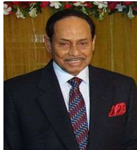
Fig-5. General Hussain Mohammad Ershad President of Bangladesh.

As Chief of Army Staff General Ershad remained loyal to Zia, killed Monjur took over power. General Ershad became the beneficiary of Zia’s death and after a bloodless coup he