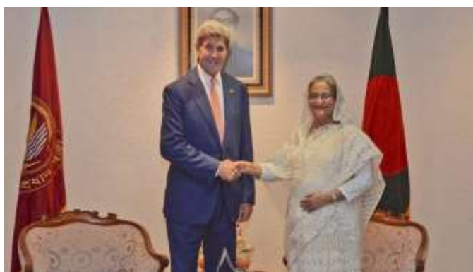
Fig-12. US Secretary of State’s came all the to praise Sheikh Hasina leadership

And her achievement (source: http://bdnews24.com/bangladesh/2016/08/29/us-secretary-of-state-john-kerry-arrives-in-dhaka ).