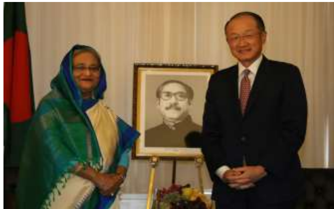
Fig-14. The World Bank President unreservedly praised her leadership and revolutionary development of the Country (source: http://bdnews24.com/WB-IMF/2016/10/15/world-bank-presidents-visit-to-smooth-out-strained-bangladesh-relations-over-padma-bridge ).

World Bank President – Jom Yong Kim) Visits Dhaka.