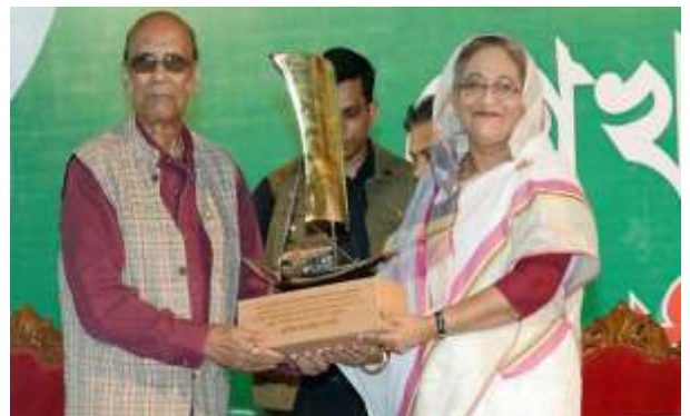
Fig-8. Sabbachachi writer presenting the title “Desh Ratna” to Sheikh Hasina.

Nagrik Committee honored the visionary leader H E Sheikh Hasina with the title Desh