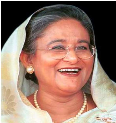
Fig-8. Honorable Prime Minister-DeshRatna-Sheikh Hasina (source:

”In 2000 six crore thirty lac (63 million) peopled lived below poverty line but the figure