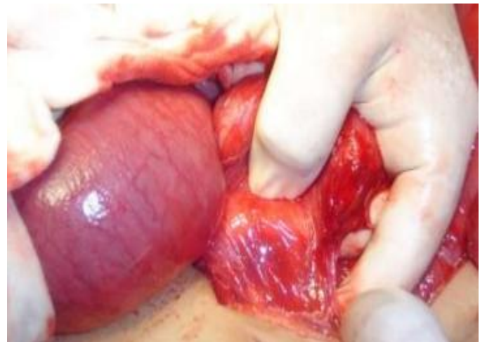
Figure 6 – 7 : Exploratory laparotomy indicating multiple adhesions band