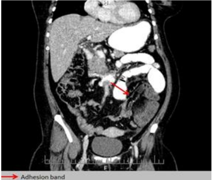
Figure1 . Coronal computed tomography image indicating main adhesion band cross over the jejunal loop, transition point, and distal collapsed bowel; presence of "beak sign" (abrupt luminal transition)

The provisional diagnosis of the surgical team was a mechanical SBO. The decision was made to perform an emergency laparotomy for adhesiolysis. The laparotomy indication of multiple adhesion bands led to jejunal loop obstruction. The patient was subjected to adhesiolysis to remove the bands. The patient recovered uneventfully and was discharged on the third postoperative day. There was no recurrence on the follow-up.