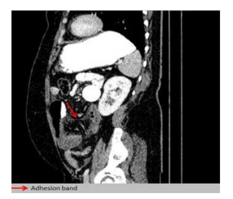
Figure2. Sagittal computed tomography image showing the adhesion bands and focal obliteration of pro-peritoneal fat line

Figure1 . Coronal computed tomography image indicating main adhesion band cross over the jejunal loop, transition point, and distal collapsed bowel; presence of "beak sign" (abrupt luminal transition)