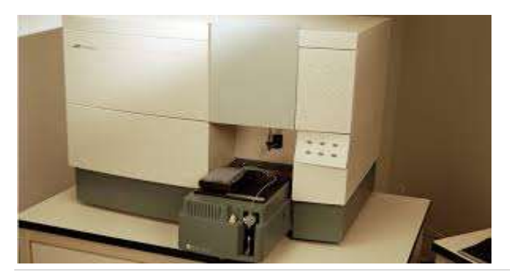
Fig. 2 FACS count (Becton Dickson Biosciences, Singapore).

CD4 count was performed by using FACS count (Becton Dickson, Singapore)