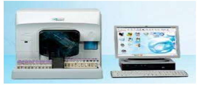
Fig. 1 hematological analyzer (sysmex XT4000i Sysmex Japan).

Five milliliters (5mls) of venous blood was collected aseptically from each participant into ethylene diamine tetraacetic acid (EDTA) tube using disposable syringe. The blood samples were used for full blood count (FBC) and CD4 count. Full Blood Count Determination The full blood was determined using a hematological analyzer (sysmex XT4000i, Sysmex Japan).