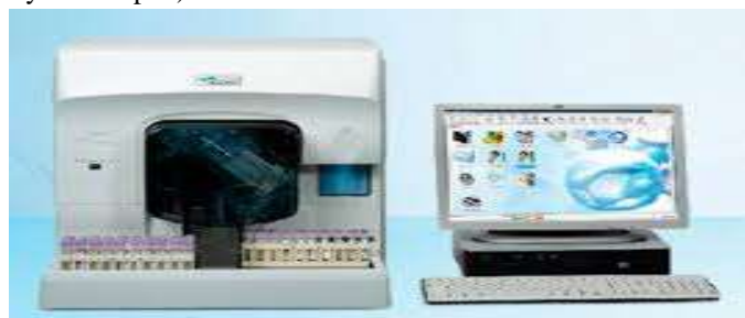
Fig. 1 hematological analyzer (sysmex XT4000i Sysmex Japan).

Full Blood Count Determination The full blood was determined using a hematological analyzer (sysmex XT4000i, Sysmex Japan).