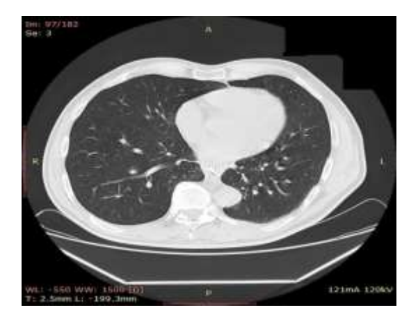
Figure 2. Computer tomography imaging

We performed a computer tomography as well (Figure 2).