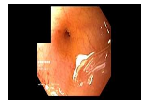
Figure 1. Esophagogastroduodenoscopy

We performed a computer tomography as well (Figure 2).