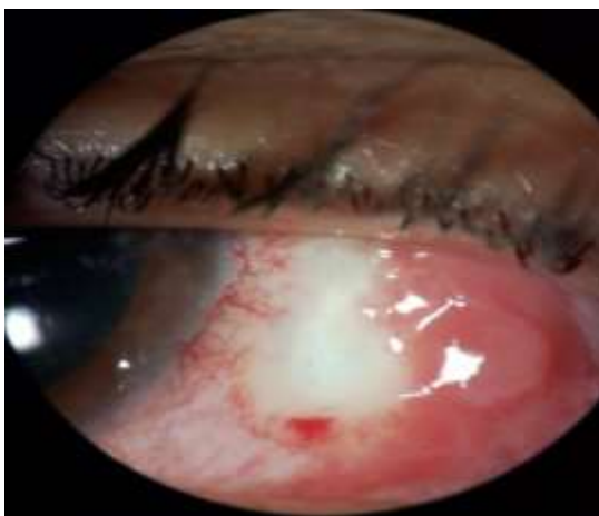
Figure 2: the evolution of scleral Dellen day 3

The light reflex was also preserved. Furthermore the examination of the eye was without any abnormality Our conduct has consisted of the hospitalization of the patient then the administration of a local antibiotherapy and artificial tears abundantly (hourly drop) then occlusion by eye dressing in the same way that a daily surveillance of the lesion evolution. An eye covering had been discussed, but we opted for a sunset. After three days, we observed a scleral cicatrization, followed by a gradual covering of the sclera by conjunctiva. Seven days later a conjunctival bud appeared. Its excision had been carried out only two after the second week. The pictures below show the evolution of the patient. (Figure 2)