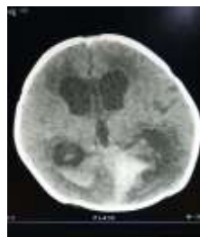
Fig2: CT scan of brain showing ICH and IVH

Ultrasonogram of brain showed HIE changes (increased echogenicity in thalamus and basal ganglia ). CT scan of brain showed increased hyperdensity in occipital horn of ventricle and in parenchyma.