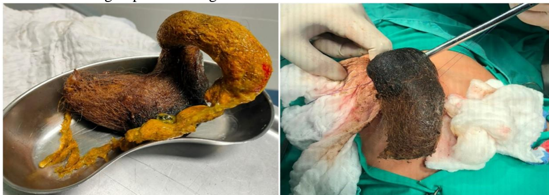
Figure 2: Intraoperative finding of trichobezoar that formulate the shape of stomach and duodenum with jejunal extension

anterior wall of the stomach ( Figure 2 ). Hence, the diagnosis of Rapunzel syndrome was established.