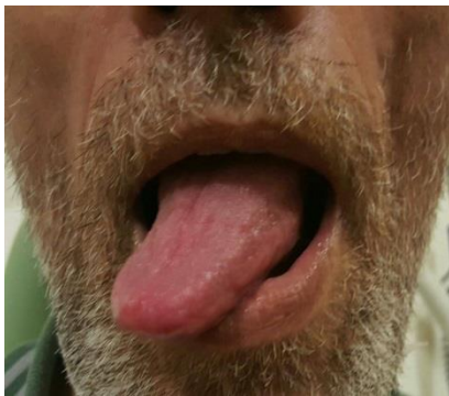
Figure1: The deviation to the right side and atrophy of right two anterior thirds of tongue.

The preliminary diagnosis was prostate cancer metastasis to skull base, occipital condyle syndrome, and endoscopic transnasal transsphenoidal biopsy was performed. The pathological examination confirmed the prostate adenocarcinoma metastasis. The patient was not a candidate for a skull base surgery. The patient's performance got worse after second dose of chemotherapy and radiotherapy, and the treatment had to be stopped. Narcotic drugs for severe headache were administered. He died after two months from diagnosis of skull base metastasis.