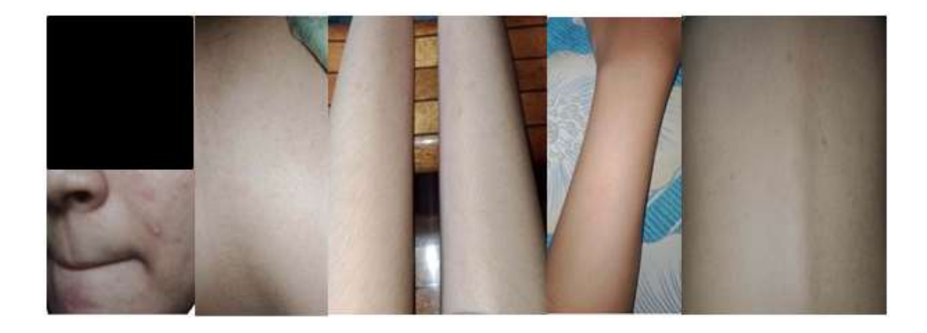
Figure 2. Ferriman and Gallwey described a visual scoring method to clinically assess the degree of hirsutism known as the Ferriman-Gallwey (FG) score. According to the FG score, hair is scored in nine parts of the body, with a score of 0 representing a complete absence of terminal hair and a score of 4 represents extensive hair growth.. Women with an FG score of 8 or higher are regarded as hirsute