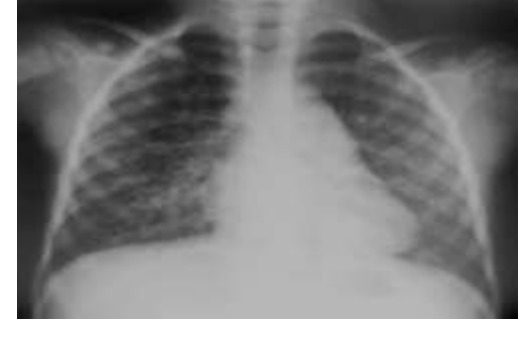
Figure 5: bronchial syndrome predominant right