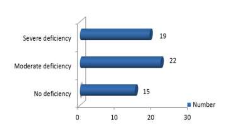
Figure 1: Distribution of patients according to CD4 count

Fifteen children (26.8%) had no immunological deficit