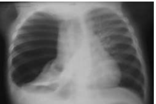
Figure 4: Right massive pneumothorax with An excavation at the stump of collapsed lung