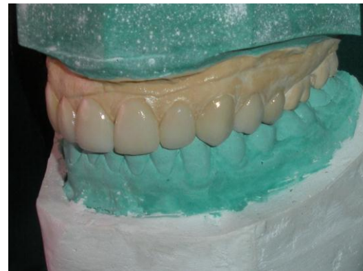
Picture 7. Laminate veneers after glazing

air abrasion and checked for the marginal integrity on the original master die (Picture 7).