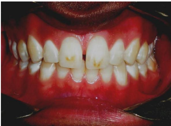
Picture 1. Intra oral view showing Dental Flourosis

incisors and 2mm wide midline diastema between the maxillary central incisors (Picture 1).