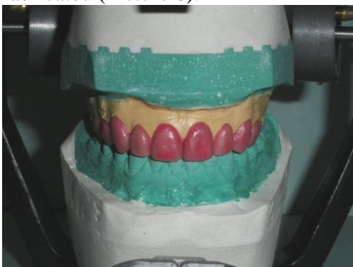
Picture 6. Wax pattern fabrication

The master casts were mounted on the semi-adjustable articulator and wax patterns were fabricated (Picture 6).