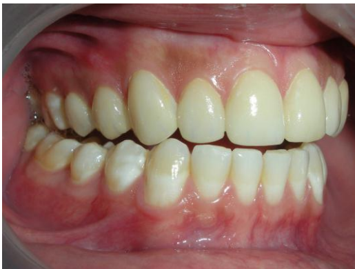
Picture 8. Right side intraoral view with canine guidance occlusion