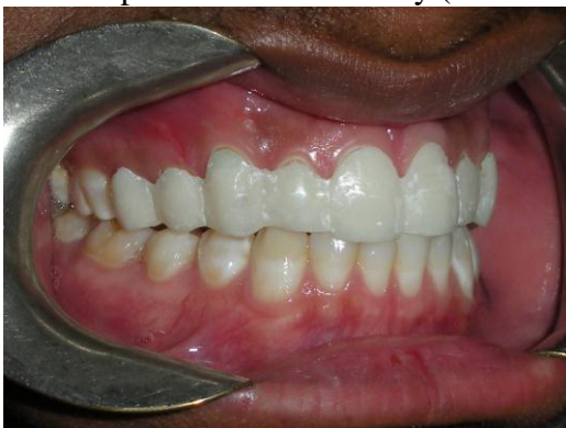
Picture 5. Provisional restoration

clearance. Before making final impression, a retraction cord of size 00 (Ultrapak, Ultradent, South Jordan, USA) was used to deflect the gingival soft tissue to expose the finish line. An addition polyvinyl siloxane impression (Zermack, Italy) was made for the maxillary arch using double mix single impression technique. Since the preparations were in the enamel, light activated microfilled composite resin was used to fabricate the temporary veneer. Two to three dots of etchants were applied on tooth surface and composite resin were built up on the prepared tooth to prevent the sensitivity (Picture 5).