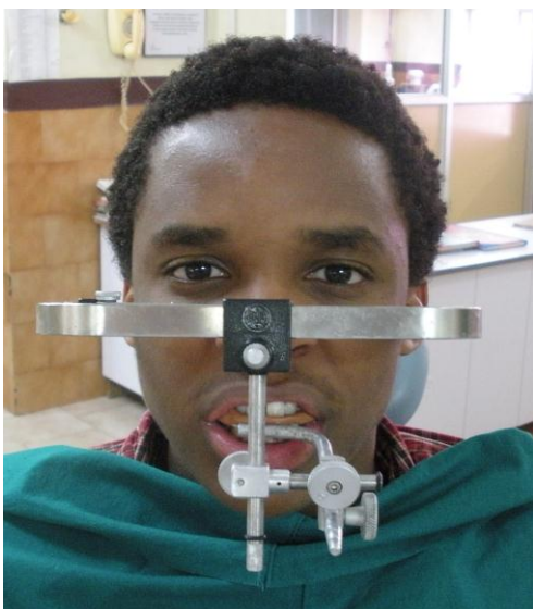
Picture 2. Face bow transfer

Diagnostic impressions of the maxillary and mandibular arches were made. Maxillary and mandibular primary casts were mounted in the semi adjustable articulator using face bow transfer (Picture 2).