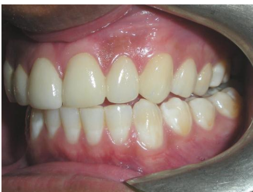
Picture 9. Left side intraoral view with canine guidance occlusion

After the initial set, the flash was removed carefully before the resin cement is completely polymerized. Additional 45-60 seconds light curing was done from lingual and labial side. Once the luting agent was polymerized, fine grit flame diamond was used to trim excess cement. The occlusion was checked and adjusted. Final finishing was accomplished with porcelain polishing agents, including rubberized abrasives and diamond polishing paste. The proximal areas were polished with finishing strips.