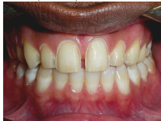
Picture 4. Tooth preparation for laminates

Tooth preparation for the maxillary anterior teeth was carried out with minimal preparation following the guidelines for the porcelain laminate veneers (Picture 4).