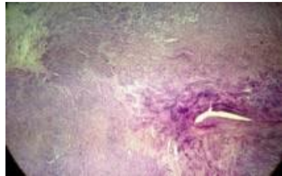
Fig C: Showing leiomyoma

Our study was done on 218 patients. Larger sample size will have a better correlation of the clinical, radiological & histopathological findings.