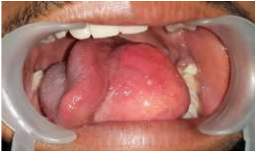
Figure 1: Preoperative view of the lesion

coloured, well-defined sublingual swelling occupying the entire floor of the mouth (Fig. 1).