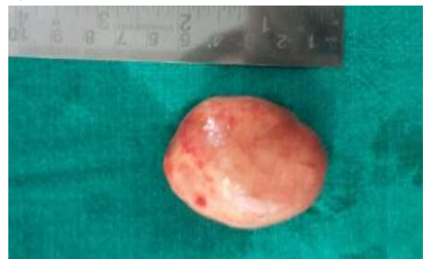
Figure 4: Excised lesion

Macroscopically, the lesion appeared encapsulated and contained a keratin like yellow material (Fig. 4).