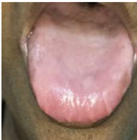
Fig.3 Showing Bald tongue representing atrophic glossitis

Majority of the cases presented with hyperpigmentation changes (53.4%), hair changes(47.4%) followed by angular chelitis (37.9%), angular stomatitis (35.3%), nail changes (32.7%), cracks on skin (32.7%), atrophic glossitis (31.8%) (Fig.3), vitiligo (31%), slatey pigmentation on face (27.5%) (Fig.4) in this study.