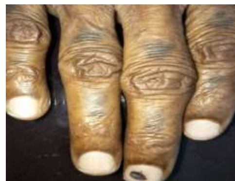
Fig.2 Hyperpigmentation over phalangeal regions and nails.