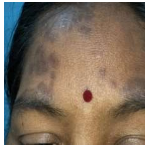
Fig.4 Slatey pigmentation over forehead

Hyperpigmentation pattern is generalized with accentuation in palms, soles, flexural areas, on phalanges, knuckles, knees, elbows. This manifestation may be the first one that appears in vitamin B12 deficiency [11]. Hyperpigmentation appears in regions where there is increase in cell turnover of tissue. Hair changes presented as brittle, luster less, early graying of hair [12]. Nail changes like longitudinal brown or black streaks appear on nail plates. Aaron et al [13] reported that 12 out of 63 (19%) patients had glossitis (31%), which was the most common mucocutaneous manifestation, followed by skin hyper pigmentation (19%), hair changes (9%), angular stomatitis (8%), and vitiligo (3%).