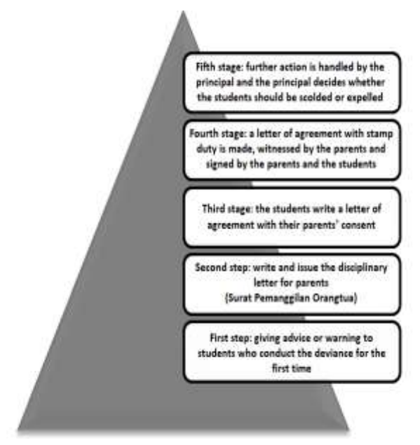
Figure 1. The Stages of Social Remedy

ignoring or neglecting norms which are inappropriate and unlawful behavior. Family background is necessary to be known in advance so that the school as an educational institution will be able to take preventive and even repressive measures with certain sanctions for offenses done by students. The school authority create the class as a fun place for interacting and as a part of the interpersonal communication development in the attitude of sympathy and empathy so it takes a firm stance against behaviors that are intorelable, for example the dishonest behavior from students will get them a warning at first, if they violates the rules again, their parents will be called and school could expelled these students. There are several steps of social remedy processes conducted by Y Senior High School, such as: