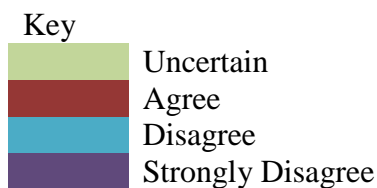
Figure 1. Comparison of dependency on white female tourists

The information above indicated that (14)70% of the respondents were not dependent for money on the white female tourists perhaps they had own source of income that they needed not to rely on the white spouse and probably they strongly disagreed to protect their ego and pride.