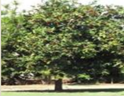
G. Mabolo, Provenance:

http://ez2plant.com/item/yard-garden-outdoor-living-fru/-mabolo-velvet-apple-fruit-tre/lid=36711049