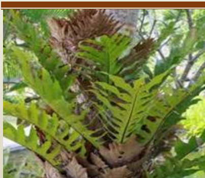
H. Kabkaban, Provenance:

There are many interesting stories behind the naming of Carcar that can be traced during and after the colonial period. Before Carcar finally got its official name, many changes happened to its previous name due to the different events back then. The first settlement of the people was called Sialo. It was a town before in which at the present is the Barangay Valladolid now. The settlement was located at the riverbank. During that period there were many Chinese traders who frequently visited the place just to trade with the natives. In the