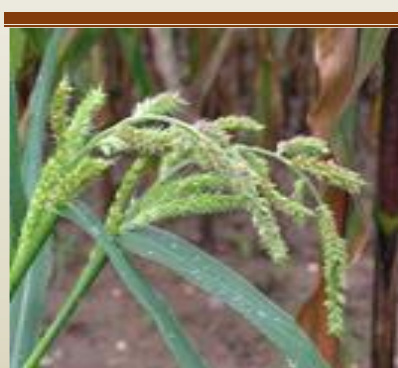
I. Balili

The barangay is named Kamagayan after a maguey plant that is described to have thorns with sturdy leaves. This is locally known as Magay with its scientific name Agave deserti . With several of these growing in the area, the place is dubbed to have named kamagayan . They recognize maguey in making rope and as a food for the horse but some would argue because it is poisonous. Though no matter what purpose maguey has contributed a long time ago. This plant can be used for making rope and its upper part can be used as a Christmas tree during the season of Christmas.