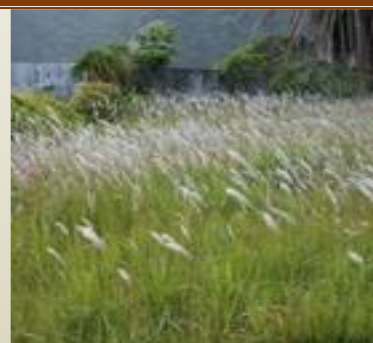
J. Cogon, Provenance: https://en.wikipedia.org/wiki/Imperata_cylindrica

Barangay Cogon is named after a cogon grass [ Imperata Cylindrica ] that flourished in the area along time ago. Cogon grass is used as food for the animals and some would agree that it could serve as their landmark. It is near the coastal area and the livelihood of the people back then up until now is fishing. No traces of cogon grass have been left in the area due to a lot of house construction