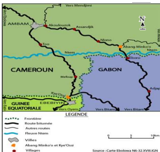
Picture 1: The area of the "three borders" (Cameroon - Gabon - Equatorial Guinea)

National Road 2 (NR2) plays an important role in the economy of the southern region and neighboring countries. That is why, for example, that all vehicles carrying goods from other regions of Cameroon to Ebolowa, the area of "three borders", to Gabon and Equatorial Guinea, daily take it. From this example we can understand why Abang Minko'o is closely linked to this road which dessert it, and allows vehicles loaded with various products to supply the market.