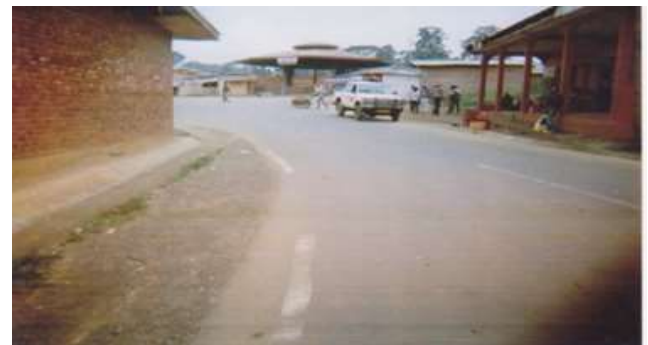
Picture 3: The main entrance of the market Abang Minko'o. to the Left the administrative building N°2. To the right one of 57 shops that make up the West. In the background one of the two secondary warehouses in place in this sector.

- In 2010, Yaounde – Ambam and Libreville - Bata roads were fully paved and bridges built on the Ntem. Great opportunities could thus be seized by the peasants and the Cameroonian and foreign economic operations, which could now enjoy the benefits that offered both these roads in good state that served, among others, the border market of AbangMinko'o (photo 3) and that of Kye'Ossi.