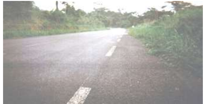
Picture 1: The National Road2 Ebolawa - Ambam near Meyo Elie to ten kilometers Ambam.

Asphaltting of the second batch Ambam - Eking serving AbangMinko'o and its market, starting in late 2002. Financed by the African Development Bank (ADB), this 27km stretch is the fourth component of the development of the region of the "three borders", the three others being Ebolowa sections - Ambam and Ambam - Kye'Ossi and two bridges on the Ntem.