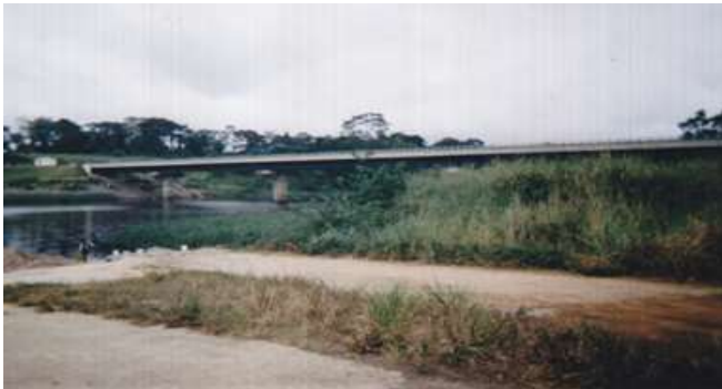
Picture 2: Bridge on the Ntem to Eking. This bridge plays an important role in trade between AbangMinko'o and Gabon

(photo 2) and another 145 meters to Ngoazik . The work which began in 2000, was completed in 2005. After the construction of these two bridges, economic and human exchanges in the area of the "three borders" would intensify.