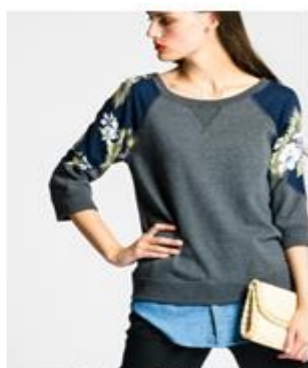
Figure 5: Blouse

Resource: http://www.preloved.ca/shop/index.php?main_page=product_info&products_id=359