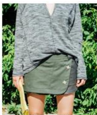
Figure 4: Skirt

Meanwhile, Preloved (2016) uses vintage fabrics as one of their fashion design. Their online business and boutique produces recycled apparels for women, children and household furnitures with more than 400 shops. As of previous season, they made sweaters out of wool for shops in America. Apart from that, they also produced skirts that can be matched recycled wool pants and similar skirts that made of wool. It was found that even celebrities bought these products such as Julia Roberts, Daria Werbowy, Kate Hudson, and Christine Horne. Their designs sometimes combine old and new fabrics in one apparel. The apparels are often price between the range of $100-$200 (Figure 5) and the skirts are sold in retail priced at $149 (Figure 4).