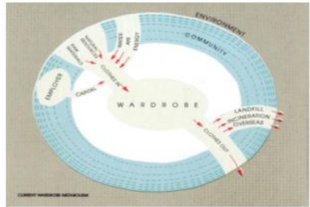
Figure 13 : Current wardrobe metabolism by Fletcher and Grose (2012)

Normally, apparel life-cycle is closely connected to the wardrobe metabolism. Wardrobe metabolism is how the apparel life starts from the second it was purchased from retailer or other resources or it was disposed or taken out from consumers' apparel stock (Xu, 2014). Fletcher and Grose (2012) concluded wardrobe metabolism in the Figure 13, simultaneously with the apparel life-cycle.