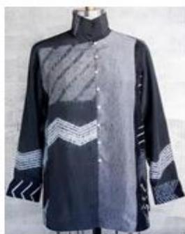
Figure 7: Blouse