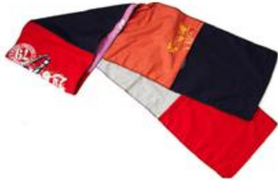
Figure 11: T-shirt Scarf

Figure 11 shows soft scarf T-shirt made in America. It was made from disposed T-shirts that are collected from apparel companies. These scarves are sewn by disabled individuals who learned to sew as a means to help them be independent.