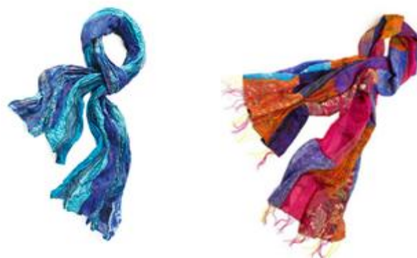
Figure 10 shows hand-made saree scarf made from 100% recycled saree (Uncommongoods, 2016). This scarf can be used as head scarf, the saree was cut into straps and hand-sewn. The scarves have various unique colour combinations, different patterns and swirled to get beautiful and wavy texture. These scarves can be worn on the shoulders or head.

Resource: http://www.bysophieb.com/2013/01/winter-13-refashioning-of-mans-sweater.html