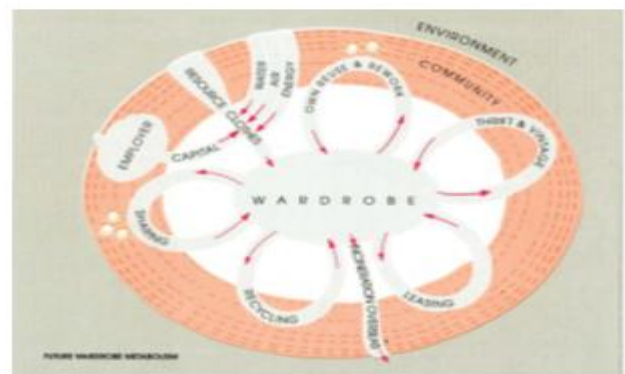
Figure 14: Future wardrobe metabolism by Fletcher and Grose (2012)

This section is related to current suggestion to develop apparels' linear life into real cycle where the consumers and the business share the synergy in them and with each other, acting as co-variable, working towards usage and usage process that is more effective. Figure 14 is the graphic illustration of how future wardrobe metabolism look like to be more effective.