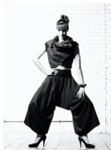
Figure 8: Sweater

Styling Junky (2016) in London, came up in the Vogue magazine and known for its innovative designs that are of high quality designed from second-hand men clothes made into women fashion apparels (Figure 8). The company also ensures that there are no same design apparels, could be from same pattern but made of different fabric. The recycled textile materials are obtained from second-hand shops. They also published a book by the name of "Junky Styling -Wardrobe Surgery" where they frequently recycle (upcycling) wardrobes. The customers can bring few old wool coats and the designers will design something new and according to current fashion. The artful and attractive apparel designs of this company were highlighted in the art exhibitions around the world and in permanent collection in the Museum of Design, London.