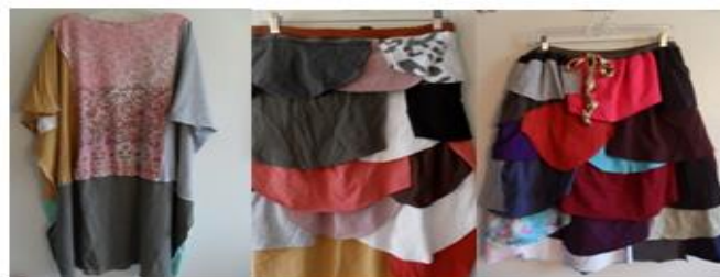
Figure 1: Cardigan

As mentioned in the fashion blog by Erica (2016) known as “fashion recycled”, which puts used apparels on auctions to be sold to charity shops, car boot sales, garage stores, thrifts stores and vintage store. This blog was developed as a way to network the whole world and provide information regarding recycling fashion, fashion styles, fashion ethics, shopping at second-hand shops and more. Figure 1, 2 and 3 illustrates designer Creolesha designing apparels from recycled apparels such as different types of arms being cut and combined together as skirts.