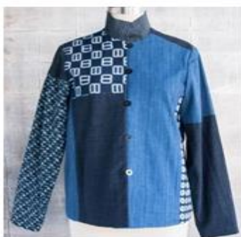
Figure 6: Jacket

Among others are Asiatica (2016), a company that produces apparels from Japanese kimono. Figure 6 and 7 illustrates the apparel designs produced which are luxurious and fashionable where they combined Japanese silk with recycled apparels (mixed vintage Japanese). They visit Japan twice a year to choose recycled materials. Apparels sold normally priced about 1450 USD